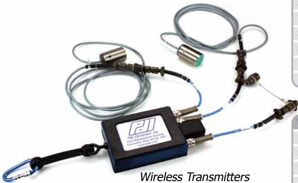
Wireless Transmitters and Proximity Switches